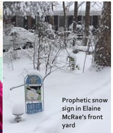
Prophetic snow sign in Elaine McRae's front yard